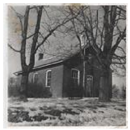
Omagh School circa. 1930