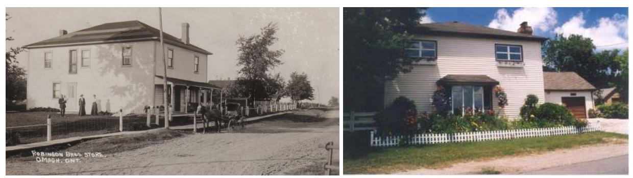
Robinson Brothers' store, Omagh c. 1920's

outside the store that ran from Fourth Line to the school and there were two tie ups for horses. The store use ceased in the 1980's and the building is now used as a residence.