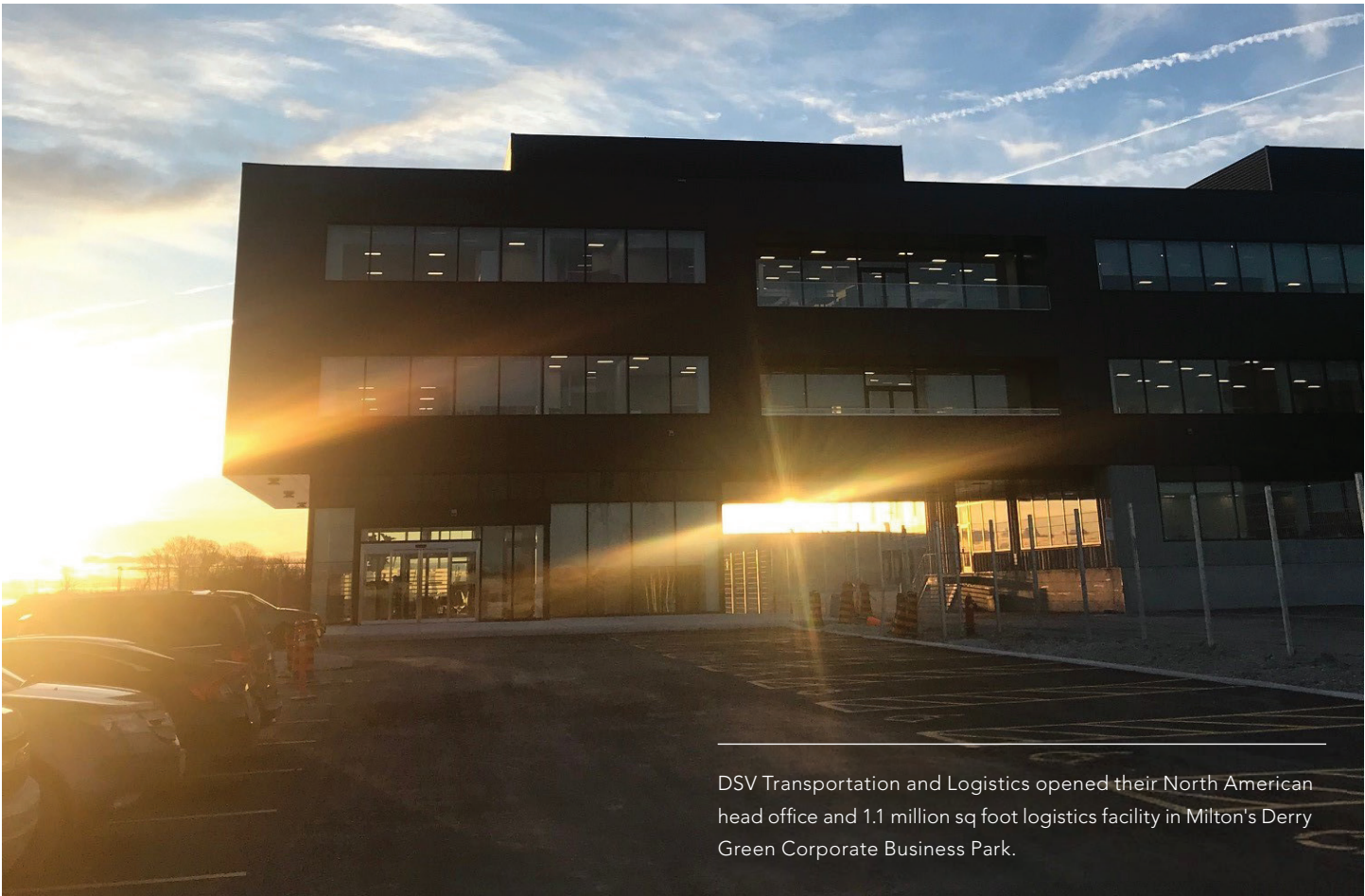
DSV Transportation and Logistics opened their North American head office and 1.1 million sq foot logistics facility in Milton's Derry Green Corporate Business Park.

The first company to break ground in Derry Green Corporate Business Park was the global transport and logistics company DSV. Relocating from a smaller facility within the GTA, DSV built their brand new 1.1 million square foot North American head office and multi-customer logistics facility is the largest of its kind in Canada.